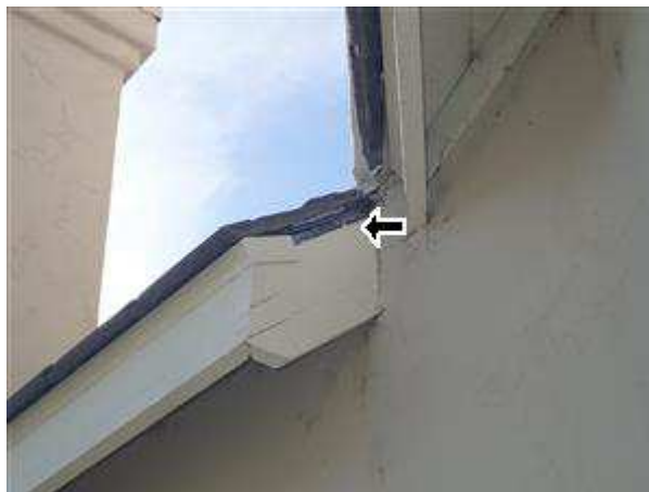
2.0 Picture 2

(2) A tile or flashing appears to be missing along a short fascia board at the east side of the living room. Recommend further evaluation from a licensed roofing contractor to determine if corrective action is necessary.