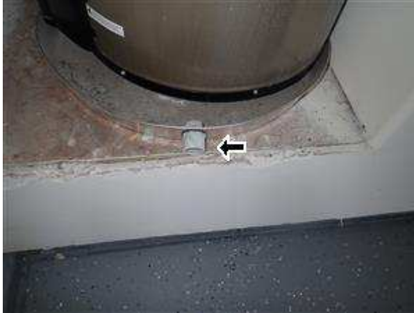
8.2 Picture 1

(3) Evidence of a previous leak was observed on top of the hot water tank. Recommend further evaluation from a licensed plumber to determine if corrective action is necessary.