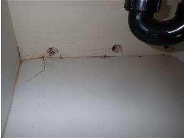
10.4 Picture 3