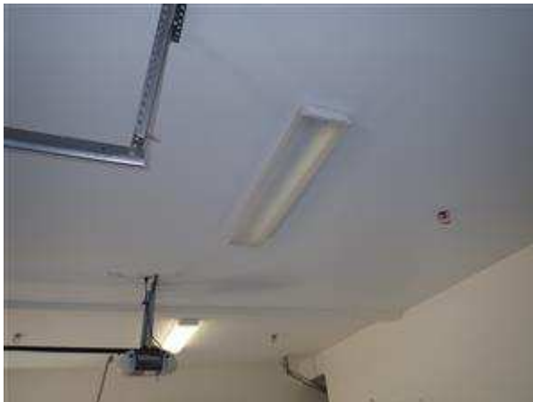
9.2 Picture 3

(2) One of the garage light fixtures did not operate. Recommend changing the bulbs and testing to determine if further corrective action is necessary.