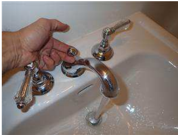
8.0 Picture 1

(1) The drain stopper in the half bathroom sink does not operate. Recommend adjusting or replacing the drain stopper linkage.