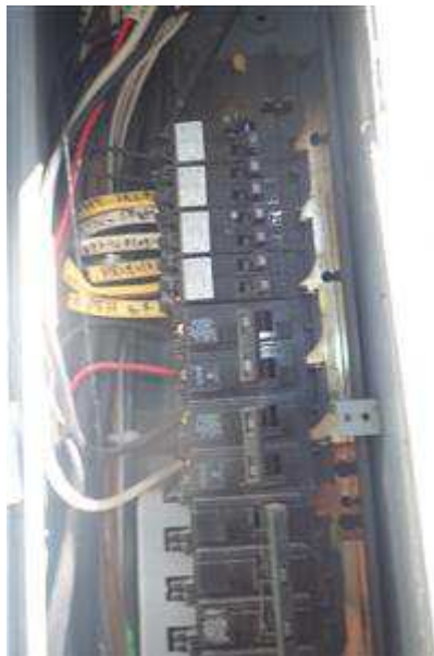
9.0 Picture 2

(3) Photo of the sub panel (located in the garage utility closet) with the service cover removed.