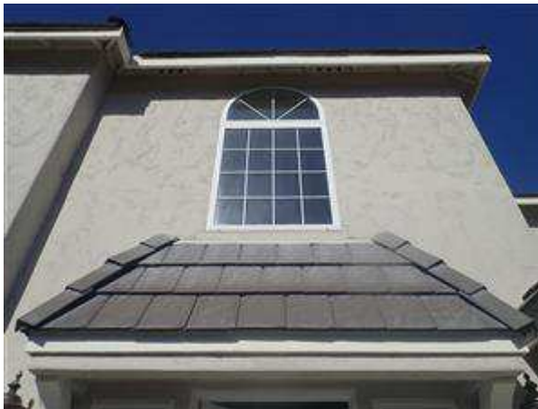
1.2 Picture 3