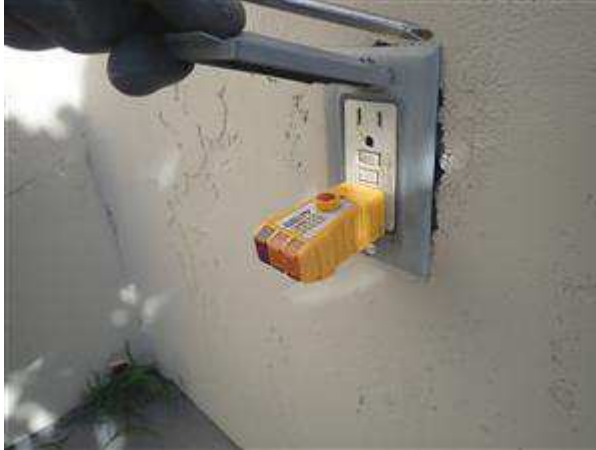
9.4 Picture 1

(2) Receptacles at the east side of the kitchen did not have power and the GFCI receptacle did not reset. Recommend further evaluation from a licensed electrician to determine what corrective action is necessary.