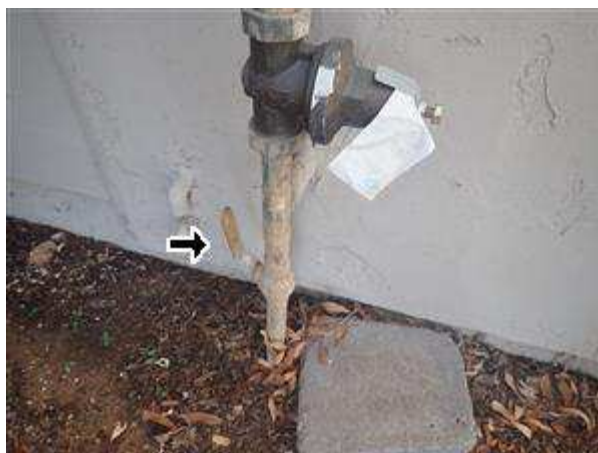
8.3 Picture 1

The main water shut off is located outside on the south side of the garage.