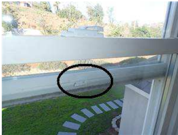
10.6 Picture 2

(2) The NE bedroom window is missing locking hardware. Recommend installing hardware to lock the window.