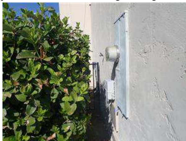
9.0 Picture 1

(1) The hedge in front of the electrical panel does not provide proper access to the panel. Recommend removing the hedge.