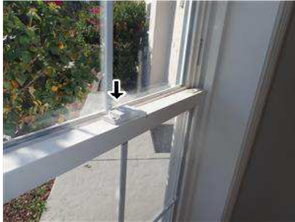
10.6 Picture 1

(2) The NE bedroom window is missing locking hardware. Recommend installing hardware to lock the window.