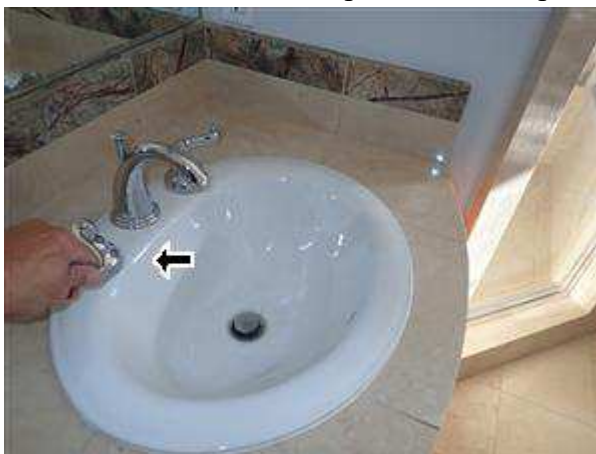
8.1 Picture 11

(9) The hot water valve at the east master sink is seized. Recommend further evaluation from a licensed plumber and repair or replace as necessary.