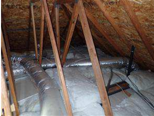
5.4 Picture 1