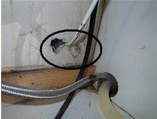
10.1 Picture 1