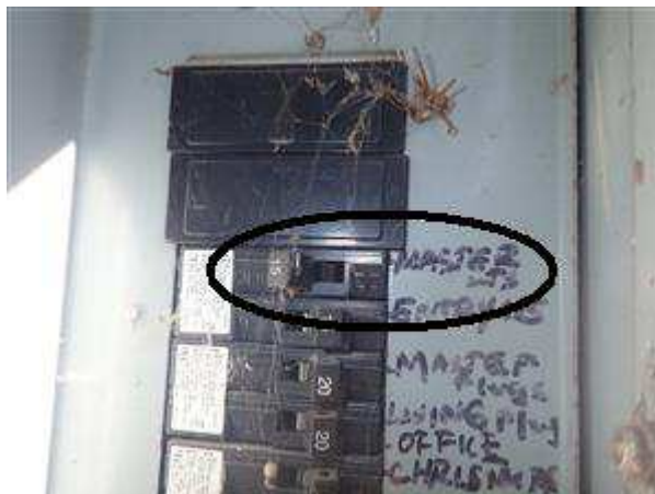
9.1 Picture 1 main electrical panel

immediately tripped suggesting an electrical short. Recommend turning on all breakers that are off, testing the circuits/lights and further evaluation by a licensed electrician to determine what corrective action is necessary.