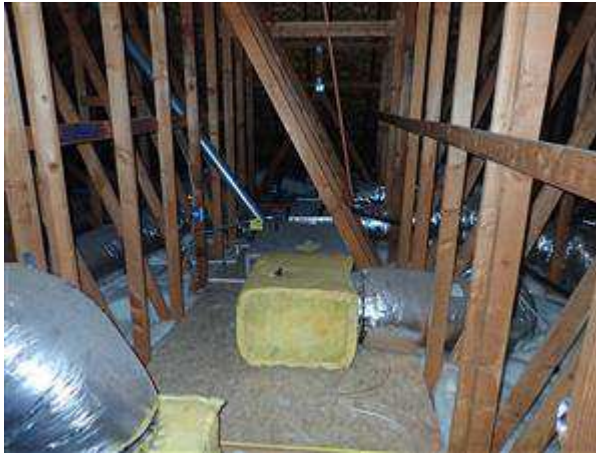
5.4 Picture 2