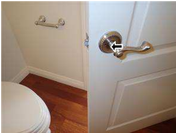
10.5 Picture 1 half bathroom

(1) The half bathroom and upper level hall bathroom doors are missing locking hardware. Recommend installing locking hardware or replacing the door knobs if privacy is desired.