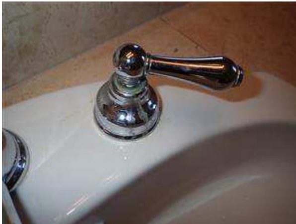
8.1 Picture 10

(8) The cold water valve at the upper level hall bathroom sink leaks when it is opened. Recommend further evaluation from a licensed plumber and repair or replace as necessary.