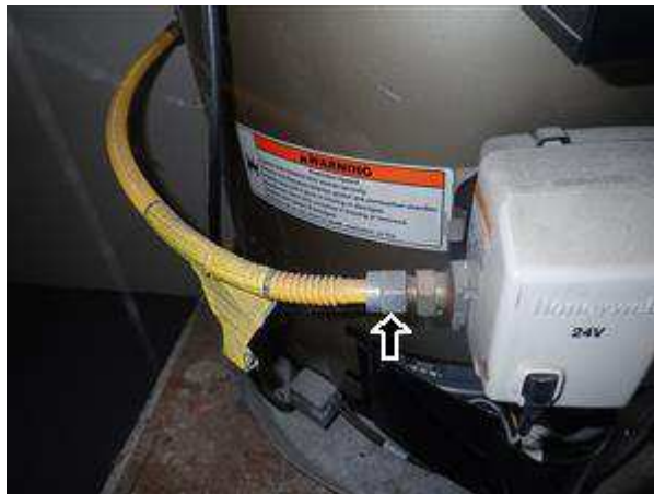
8.2 Picture 3