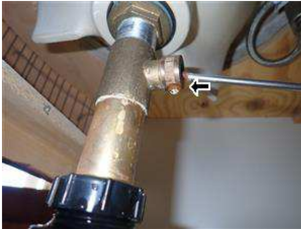
8.0 Picture 3

(3) A leak was detected at the west master sink drain. Recommend repair by a qualified person.