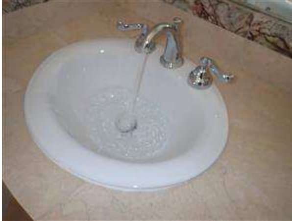
8.0 Picture 2

(3) A leak was detected at the west master sink drain. Recommend repair by a qualified person.