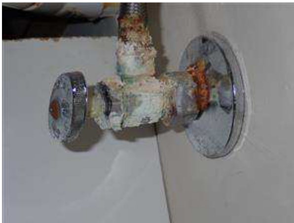
8.1 Picture 5 upper level hall bathroom