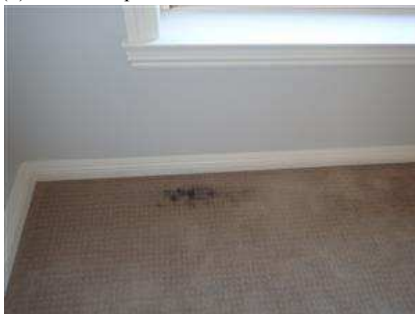
10.2 Picture 3

(4) Stains are present in the master bedroom and master closet carpet.