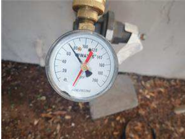
8.1 Picture 1

(2) Recommend caulking gaps adjacent to plumbing fixtures including behind the kitchen sink.