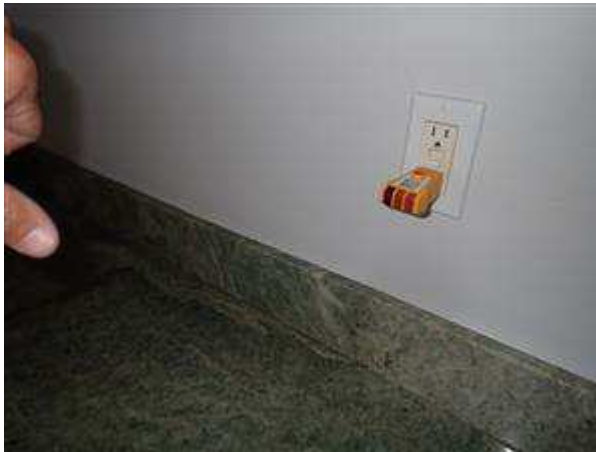
9.4 Picture 2

(2) Receptacles at the east side of the kitchen did not have power and the GFCI receptacle did not reset. Recommend further evaluation from a licensed electrician to determine what corrective action is necessary.