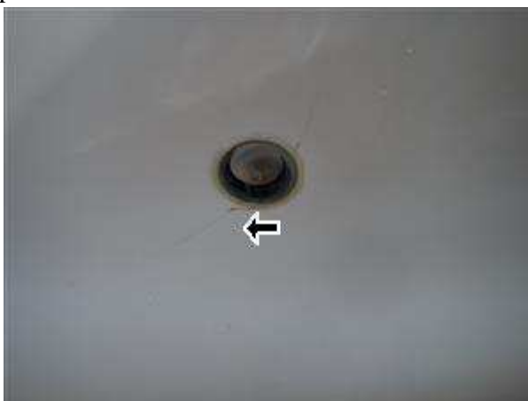
8.1 Picture 12

(10) The east master sink is cracked. Recommend replacing the sink by a licensed plumber.