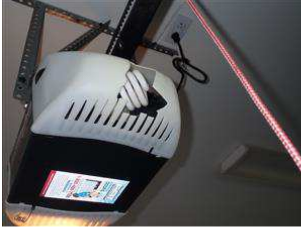
6.5 Picture 1