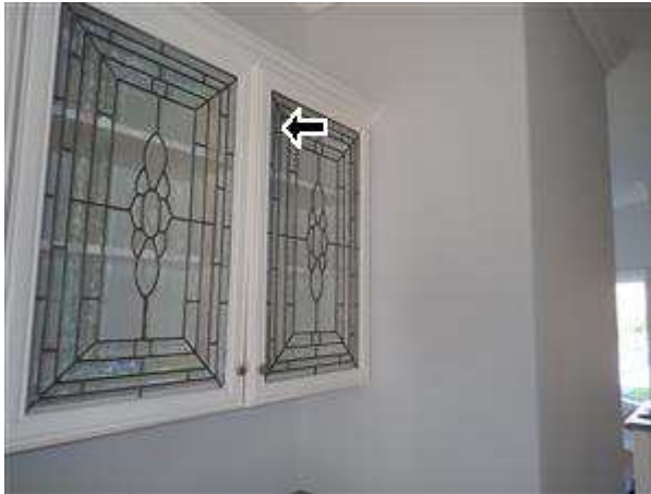
10.4 Picture 2

(2) The cabinet doors between the kitchen and dining room are out of alignment. Recommend adjusting the door hinges.