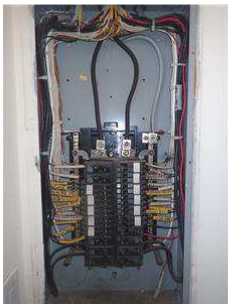
9.0 Picture 3

(3) Photo of the sub panel (located in the garage utility closet) with the service cover removed.