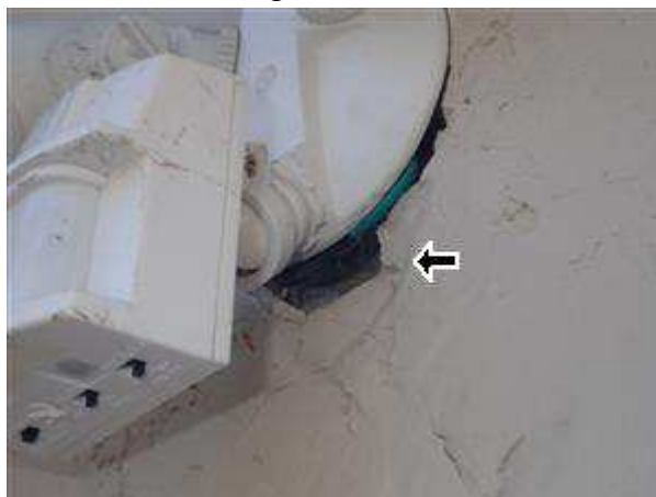
1.0 Picture 1

(1) A gap is present around a light fixture at the east side of the living room. Recommend sealing the area.