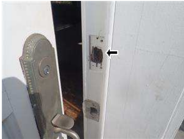
1.1 Picture 1

(1) A striker plate is missing at the main entry door. Recommend installing a striker plate for the deadbolt lock to provide added security.