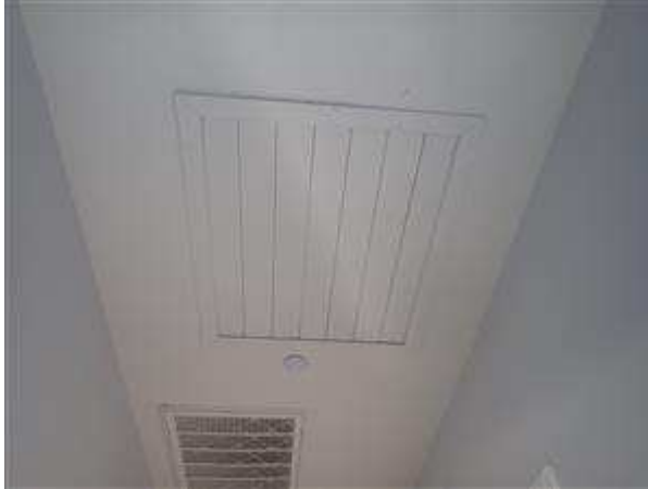
4.3 Picture 1