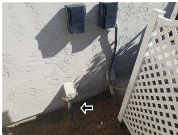
3.8 Picture 1

A condensing unit is not available for one of the zones which appears to be the upper level of the home. The home is plumbed for future A/C if desired.