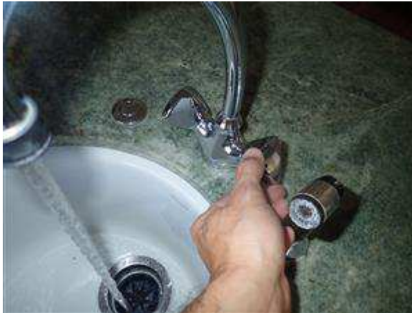
8.1 Picture 7

(6) The cold water valve for the kitchen island sink turns 360 degrees without a stopping point. Recommend repair or replacing the faucet by a licensed plumber.