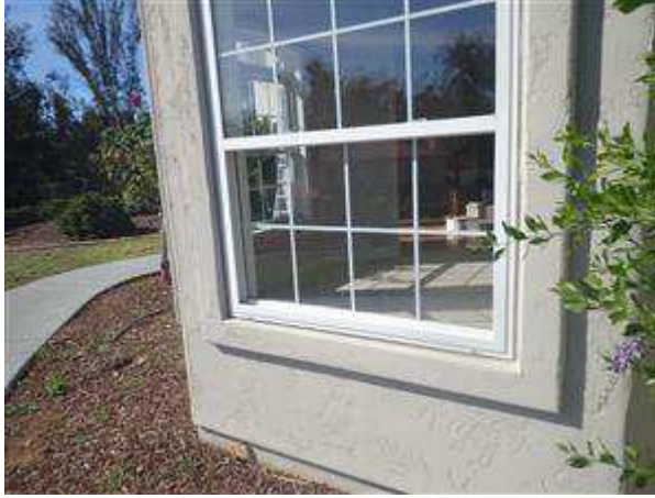
1.2 Picture 1