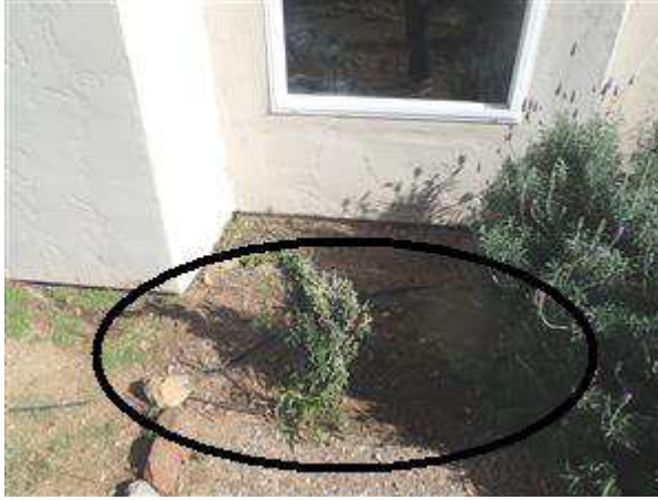
1.4 Picture 1 west side of the home

(2) The outdoor kitchen is beyond the scope of this inspection however some tiles have fallen off of the countertop.