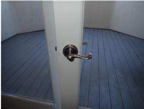
1.1 Picture 3

(3) Locking hardware is not available for the master study french doors presenting a security concern. Recommend installing locking hardware.