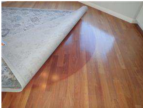
10.2 Picture 2 breakfast nook

(3) Some of the quarter round base trim is not secured in the NE storage room.