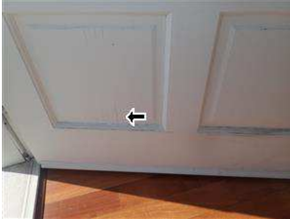
1.1 Picture 2

(3) Locking hardware is not available for the master study french doors presenting a security concern. Recommend installing locking hardware.