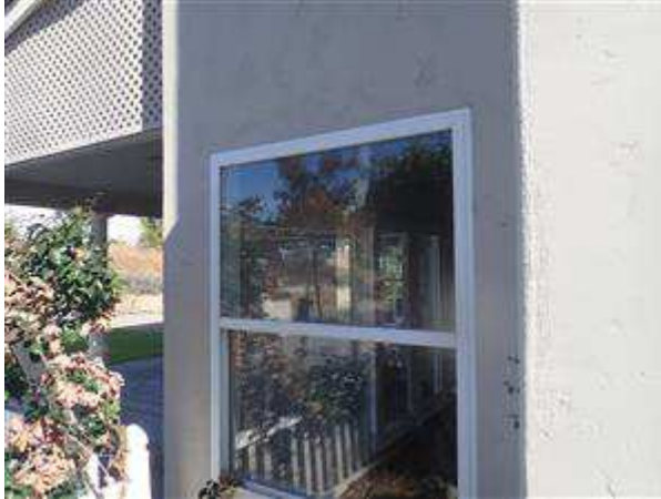
1.2 Picture 4

(2) Most of the window screens were not installed at the time of inspection. Screens were observed in the garage.