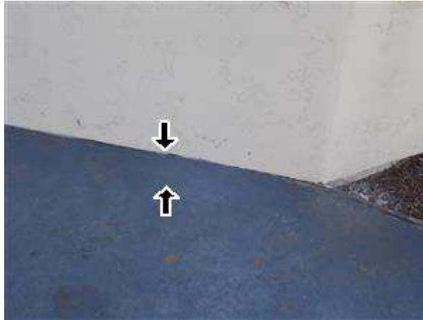
1.0 Picture 2