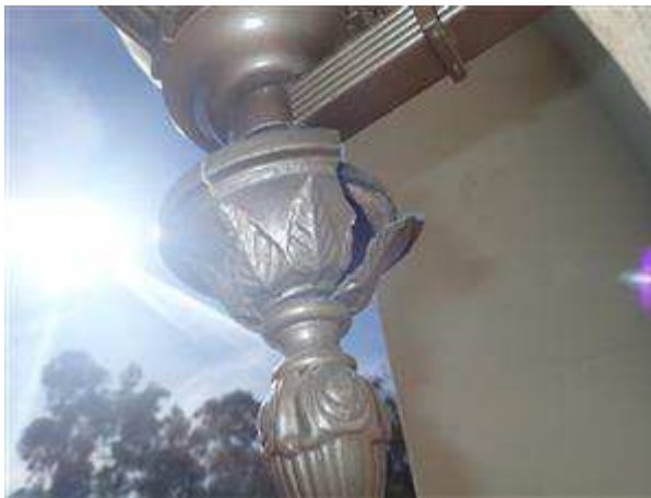
9.2 Picture 2

(2) One of the garage light fixtures did not operate. Recommend changing the bulbs and testing to determine if further corrective action is necessary.