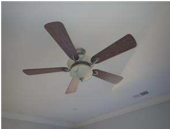
9.2 Picture 5

(5) The master bedroom ceiling fan did not operate. Recommend determining if power is available or if a remote is missing.