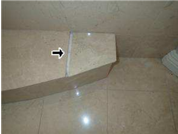
10.2 Picture 1

(1) Some of the floor tiles in the master bathroom were not properly secured and may become loose or crack over time. One tile at the bathtub step is not secure. Recommend securing the tile by a qualified person.