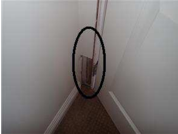
10.5 Picture 2

(3) The master water closet door comes in contact with it's jamb when closed. Recommend adjusting door and/or hardware.