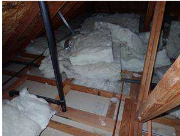
4.0 Picture 1

Some of the attic insulation was out of place. Recommend adjusting the insulation where necessary.