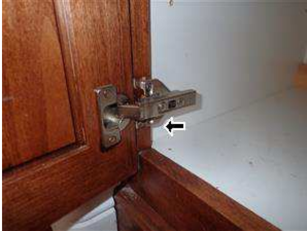
10.4 Picture 1

(2) The cabinet doors between the kitchen and dining room are out of alignment. Recommend adjusting the door hinges.