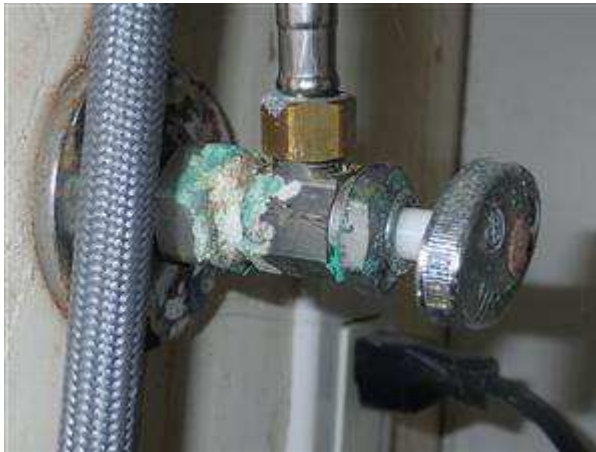
8.1 Picture 4 Kitchen

(5) Some of the angle stops were corroding and may have a limited servicable life remaining. Recommend further evaluation from a licensed plumber and replace as necessary.