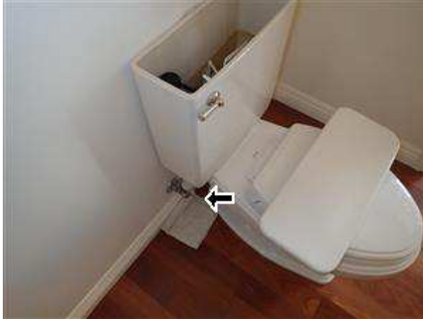
8.1 Picture 3 Half bathroom

(5) Some of the angle stops were corroding and may have a limited servicable life remaining. Recommend further evaluation from a licensed plumber and replace as necessary.