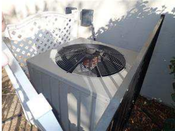
3.7 Picture 1

(1) The condensing unit did not operate when tested. Recommend further evaluation from a licensed HVAC contractor and repair or replace as necessary.