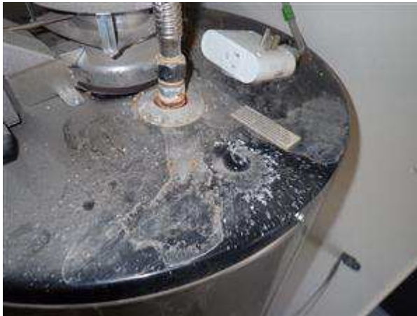
8.2 Picture 2

(3) Evidence of a previous leak was observed on top of the hot water tank. Recommend further evaluation from a licensed plumber to determine if corrective action is necessary.