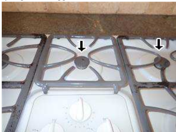
7.1 Picture 1

Two of the igniters in the cooktop did not operate when tested. Recommend repair by a qualified appliance technician.