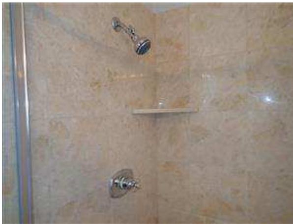
8.1 Picture 9

(8) The cold water valve at the upper level hall bathroom sink leaks when it is opened. Recommend further evaluation from a licensed plumber and repair or replace as necessary.