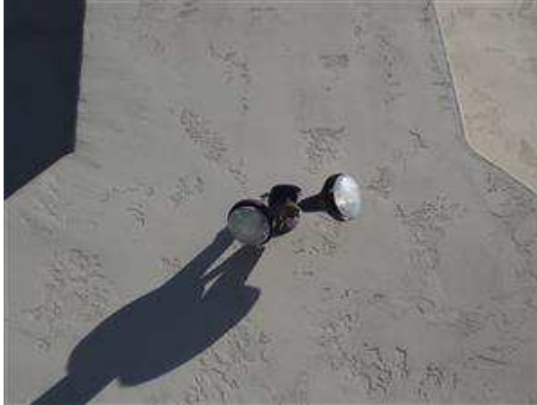
9.2 Picture 1 west fixture