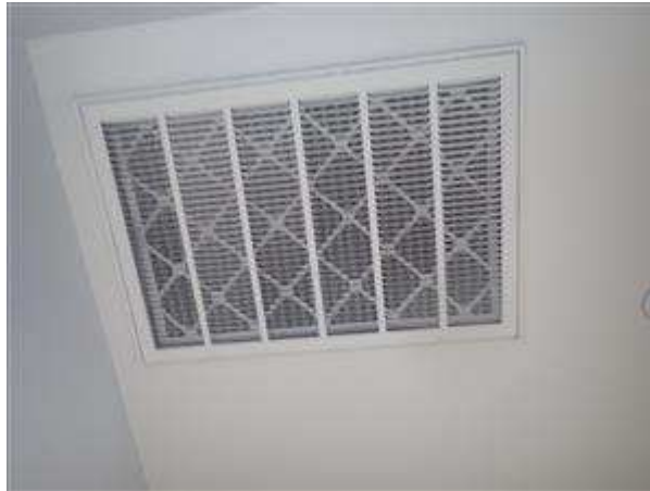
3.3 Picture 1

The air filters are dirty and should be replaced and secured before operating the heating or cooling systems.