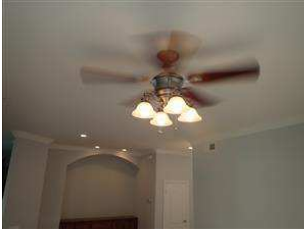
9.2 Picture 4

(4) The family room ceiling fan and master study fan are somewhat noisy in the opinion of the inspector.