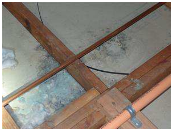
10.0 Picture 1

(1) Stains and a mold like substance were observed on the upper level hallway ceiling from the attic. Recommend asking the seller for any leak history and removing the substance by a qualified professional.