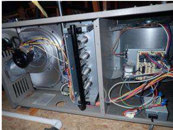
3.0 Picture 1 Unit 1

(1) Photo of the heating equipment with the service panels removed.