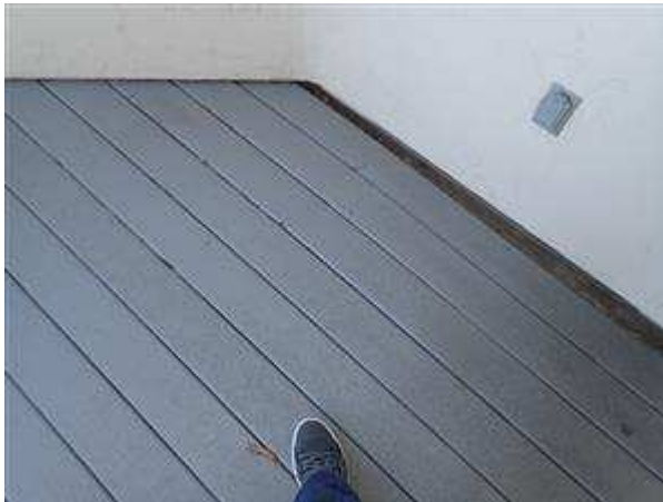
1.3 Picture 1

Some of the master deck boards are not properly secured. Recommend securing where necessary by a qualified person.