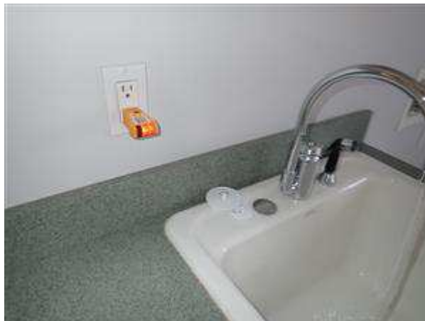
9.4 Picture 3

9.5 LOCATION OF MAIN AND DISTRIBUTION PANELS Comments: