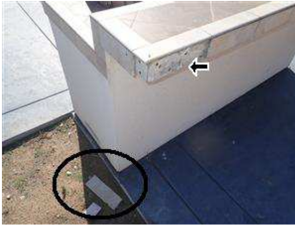
1.4 Picture 2

(2) The outdoor kitchen is beyond the scope of this inspection however some tiles have fallen off of the countertop.