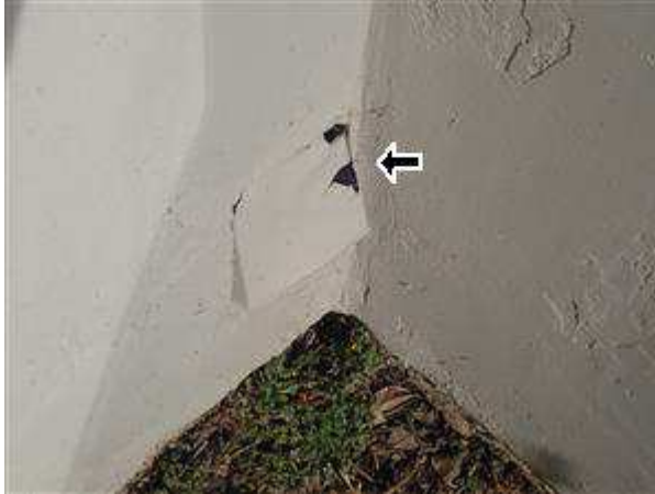
3.6 Picture 1

(2) A gap was present around the family room fireplace gas pipe. Recommend applying an appropriate fireproof material to seal the gap by a qualified person.