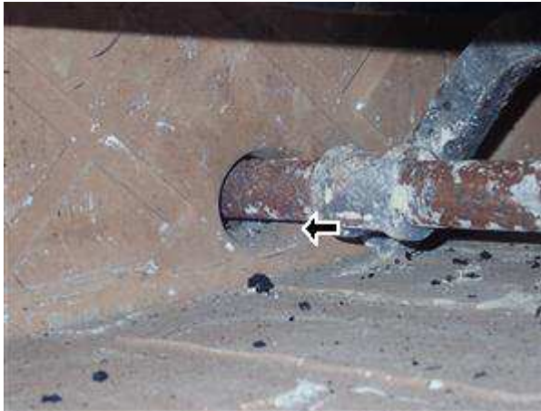
3.6 Picture 2

(2) A gap was present around the family room fireplace gas pipe. Recommend applying an appropriate fireproof material to seal the gap by a qualified person.