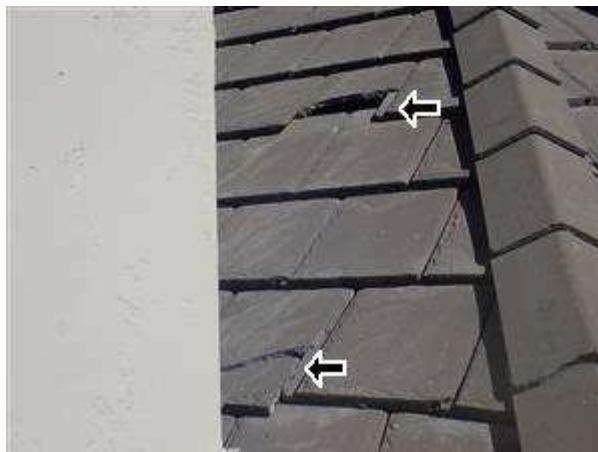
2.0 Picture 1

(1) Two damaged roof tiles were observed above the west side of the living room (right side of the main entryway). Recommend further evaluation from a licensed roofing contractor and repair or replace as necessary.