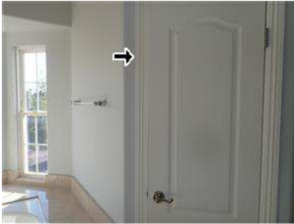
10.5 Picture 3

(3) The master water closet door comes in contact with it's jamb when closed. Recommend adjusting door and/or hardware.