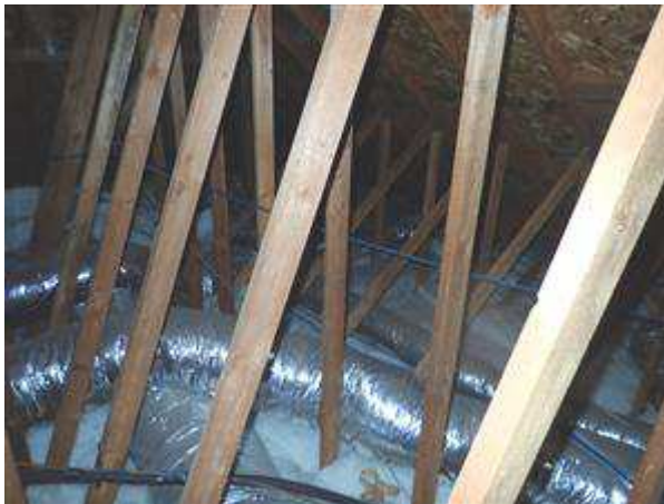
5.4 Picture 3