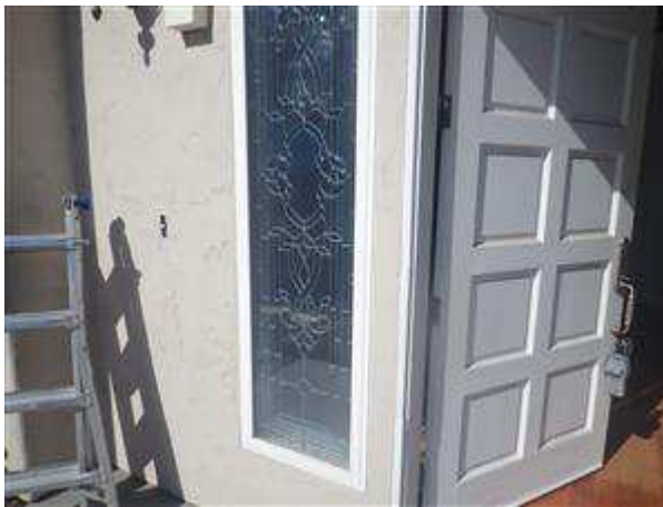
1.2 Picture 2