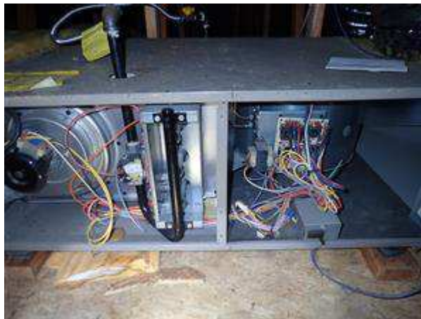
3.0 Picture 2 Unit 2