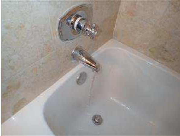
8.1 Picture 8