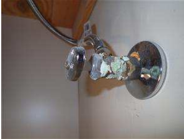
8.1 Picture 6 master bathroom

(6) The cold water valve for the kitchen island sink turns 360 degrees without a stopping point. Recommend repair or replacing the faucet by a licensed plumber.