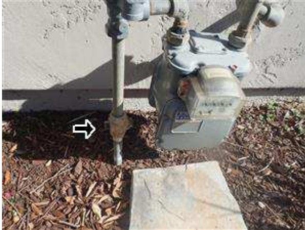
8.5 Picture 1