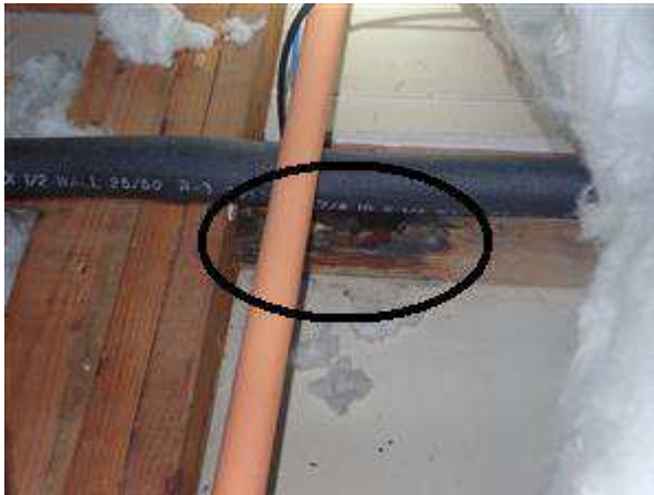
8.1 Picture 2

(3) A leak was detected below an insulated copper supply pipe in the attic (adjacent to the whole house fan). Recommend further evaluation from a licensed plumber and repair as necessary.