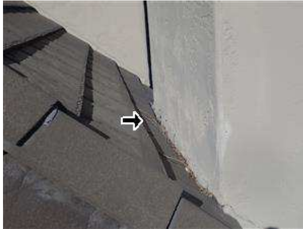
2.2 Picture 1

Cricket flashing was not installed behind the chimneys which would not meet current industry standards. Recommend further evaluation from a licensed roofing contractor to determine if corrective action is necessary.