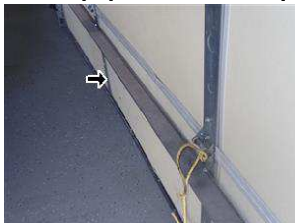
6.3 Picture 1

The two car garage door is bent. The door opened and closed properly when tested.